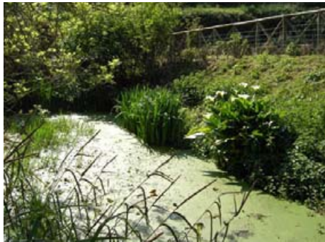
Small Pond at Beeson

High in the sky the sickle-shaped wing of the swifts can be heard along with their high-pitched evocative screams.