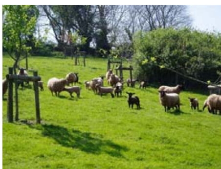
Beeson Orchard & Grazing Sheep