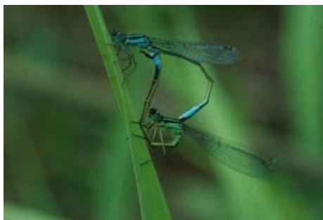
Blue Tailed Damselfly

Beeson Farm has two ponds; the top pond is smaller and has water lily, yellow flag iris, common water plantain, marsh marigold and water mint. It has duckweed covering the surface but this does not restrict the waterlife. Frogs and newts breed in the pond and damsel and dragonflies emerge from the pond to reach the last stage in their lifecycle. Common Blue, blue-tailed and black tail skimmer are but a few of the species that can be seen.