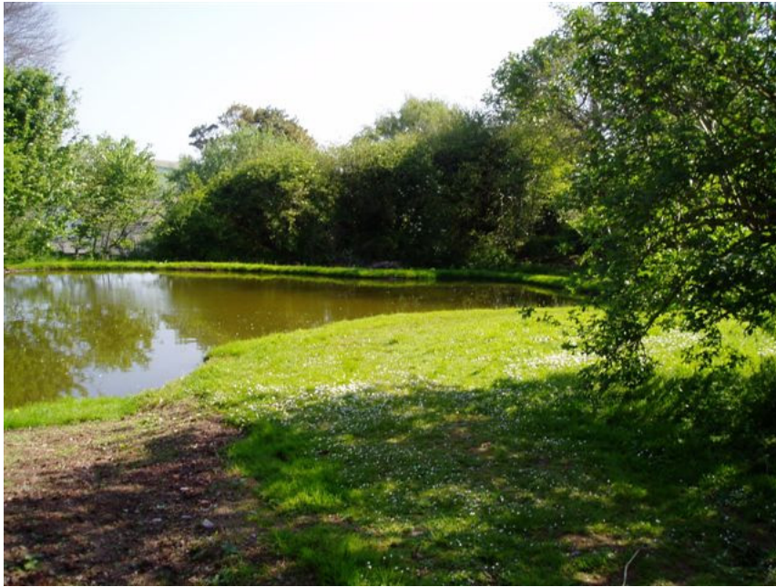
Beeson Large Pond

The larger pond has been newly created and in time will become established with more plants. The surrounding area has been left to nature, bluebells, red campion, primroses and cow parsley can all be easily seen. A hedgerow lines the area with tree species including hazel, blackthorn, hawthorn and willow, with a large ash tree in the corner. Black caps with their chortley fruity song can be heard singing from within the scrub along with the easily identified chiffchaff (it sings its own name) and the willow warbler with its descending song. Other species such as blackbird, song thrush, dunnock, robin, goldfinch, bullfinch, chaffinch and wren can also be seen.