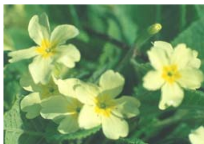
Red Campion and Primrose