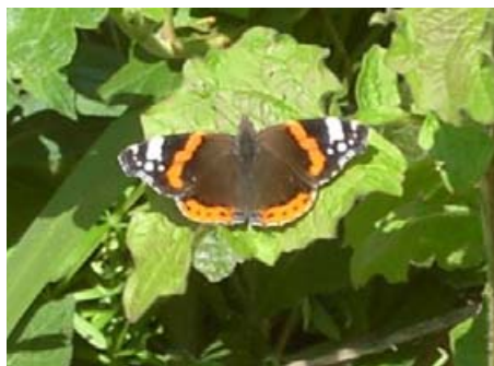
Red Admiral Butterfly

A mix of shrubs along the back edge of the pond includes hawthorn, willow and dogwood. These are good cover for birds such as black cap and willow warbler. There is a buddleia in the corner, which when in flower is a good nectar source for butterflies.