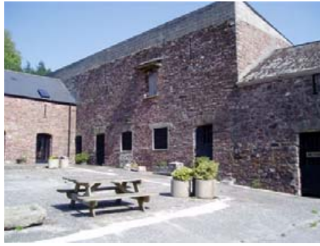
Beeson Barns and Courtyard

Pied wagtails can often be seen strutting proudly around the courtyard with their unmistakable bobbing tail. The swallows are a spectacular sight to behold as they reel around the courtyard chattering happily. Take a closer look in the barns at their nests which are made from little balls of mud collected in the beaks of the adults.