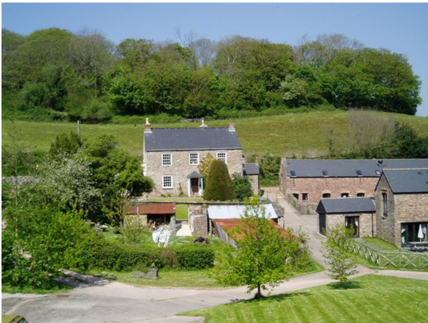
View of Beeson House and Surrounding Countryside

Beeson Farm is nestled on the edge of Beeson hamlet, with a stunning view from above the property down towards the sea. It is set in 2.5 acres of land, with two ponds and an acre of orchard which is grazed intermittently by sheep. The farm comprises a main Georgian farmhouse and an adjacent courtyard of Victorian barns which have been converted into holiday accommodation. Not all the barns have been converted and the unconverted provide nesting sites for a significant number of swallows that can be seen flying around the courtyard through the summer months.